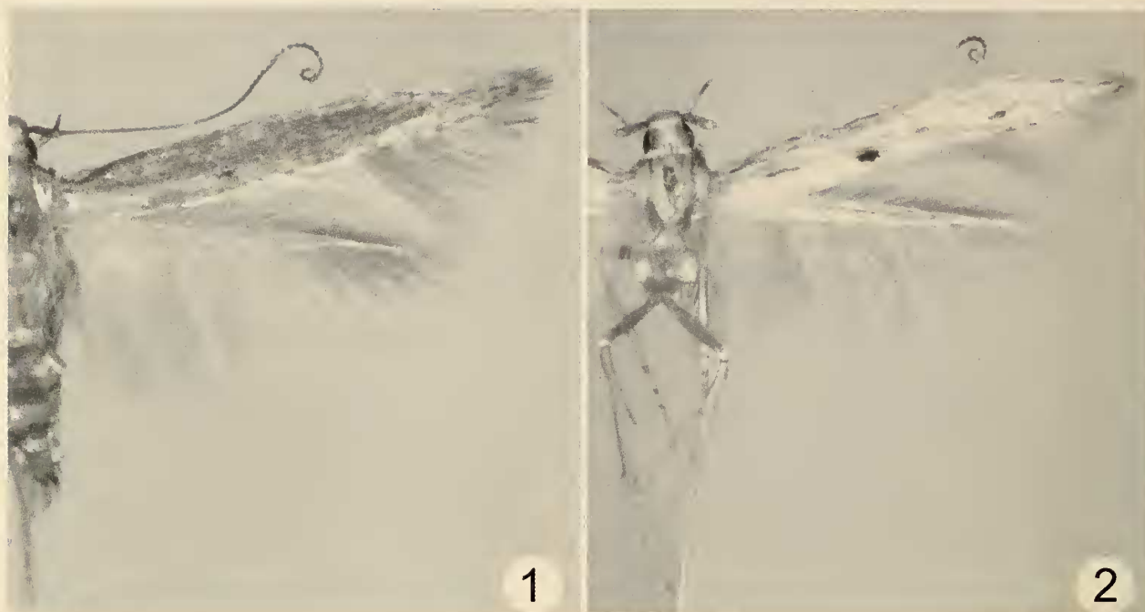
FIGS. 1-2. Adults of Haplochrois galapagosalis . 1. Female from Isabela (Volcan Darwin, 1000 m elev.). 2. Female from Isabela ( \pm 15 km N Puerto Villamil).